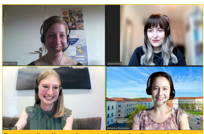
German celiac disease day was organized online to raise awareness about celiac disease

https://www.interreg-danube.eu/news-and-events/programme-news-and-events/7563